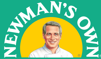
DON'T Scale elements