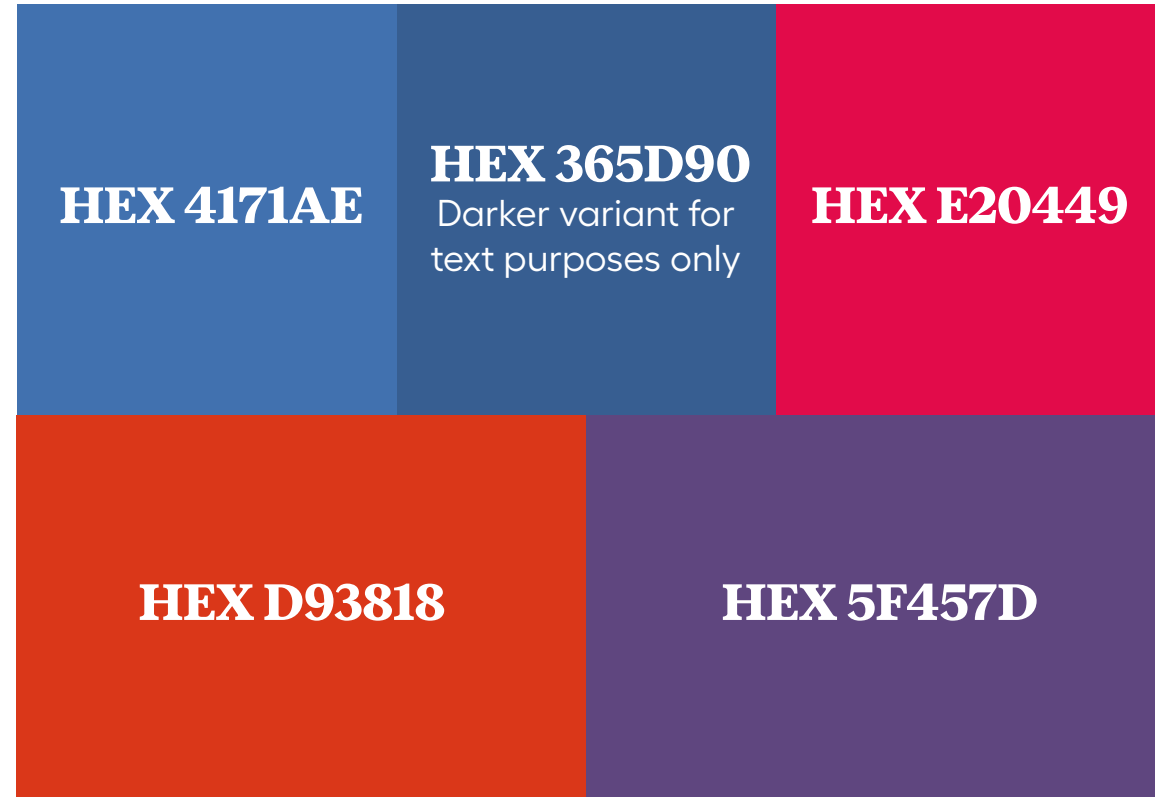
Secondary Digital Palette