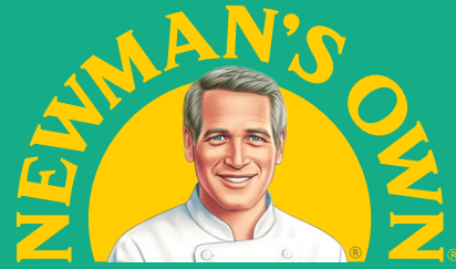
DON'T Alter colours